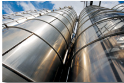
Silo farm for bulk storage