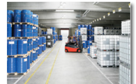
Container storage yard