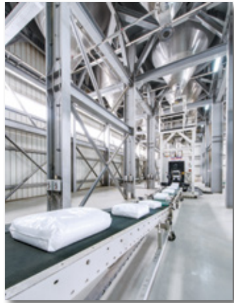
Bagging of solid products