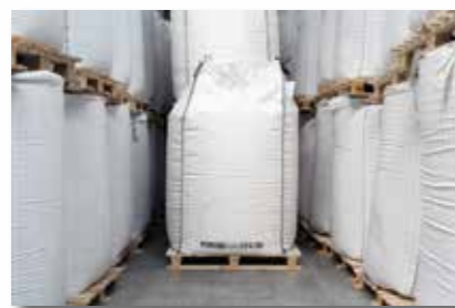
Value added services