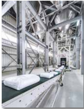
Bagging of solid products