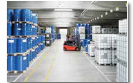
Container storage yard