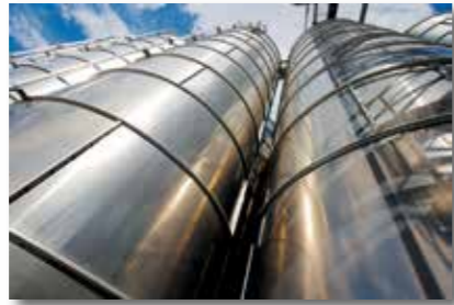
Silo farm for bulk storage