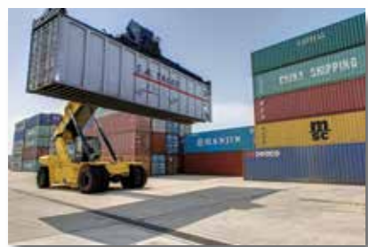
Container storage yard